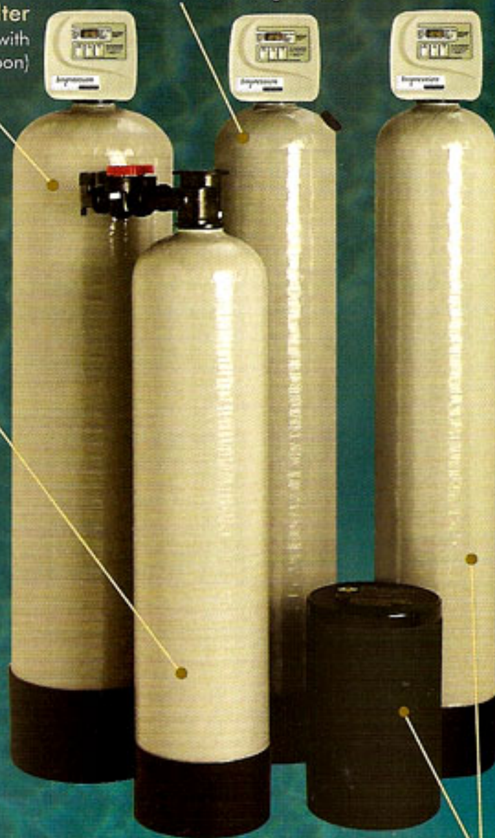
IMAF-GS Series Filters (Automatic Sulfur/ Iron Filter)

The Impression Series® acid neutralizers and filters are used commonly in combination with the Impression Series water softeners to successfully treat the most challenging water conditions, whether from city or well sources. When properly configured with the help of a Water-Right dealer, your Impression Series system can provide the quality water you want without all the unwanted minerals, hardness, odors, tastes or acidity.